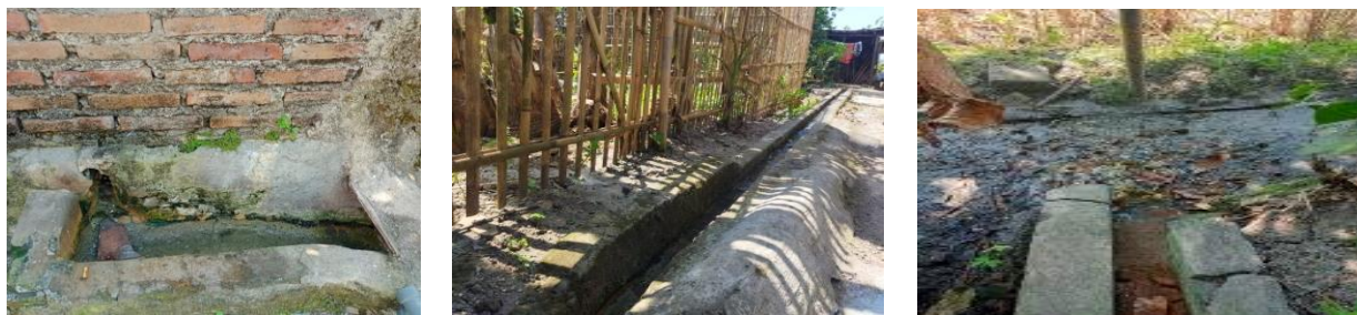
Figure 3: Liquid waste line

On this occasion the team directed the partners to start thinking about the legality of the business. Due to the legality of the business, partners can have a wider relationship, especially when they need business capital for business expansion. And the KPM Team recommends partners register for permits through OSS. The KPM TEAM provides education on how to register for a business license online; Regarding the safety and hygiene of products, especially tempe processed products, the team directed them to register for PIRT.